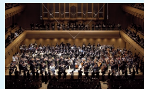
*1 All Japan College Orchestra Festival