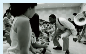
*3 Jazz at Lincoln Center in YOKOHAMA